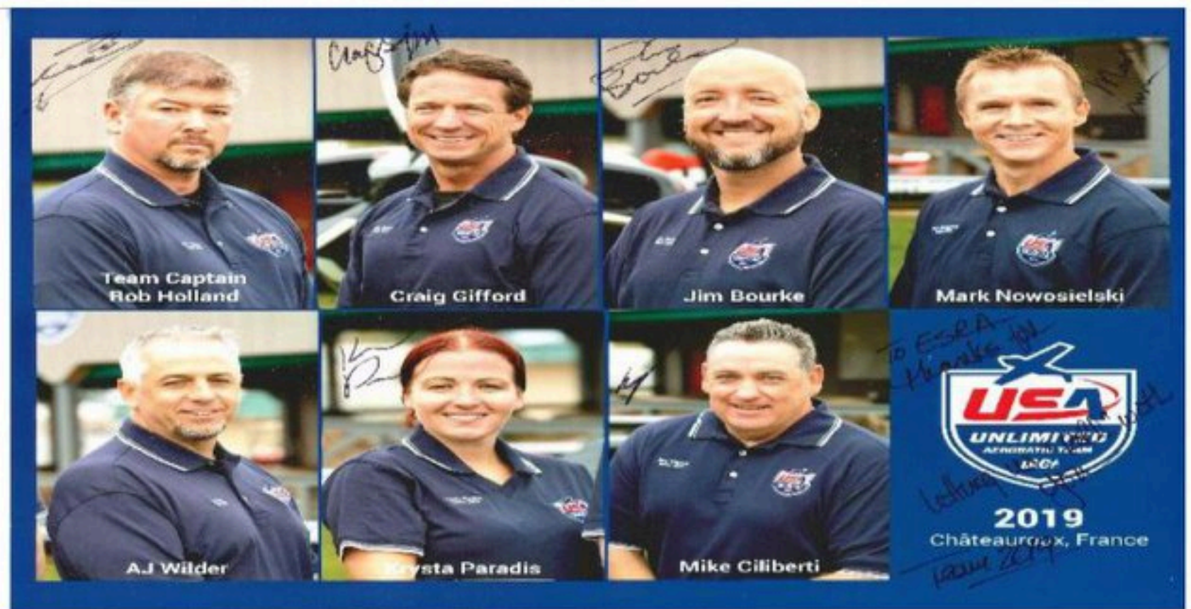
Presented by the team at ESRA prior to the Championships.

The team, after training at ESRA, claimed silver at the FIA World Championships in France.